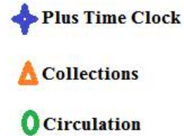
JFK Library Main Floor