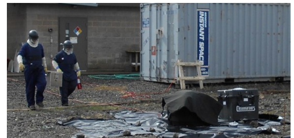
Deactivation of High Hazardous Waste

For questions regarding waste and chemical recycling, contact Kathy Kees x2788.