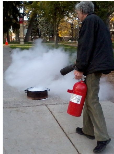
Fire Extinguisher Training