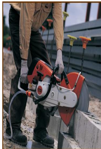
Wet cut saw in action