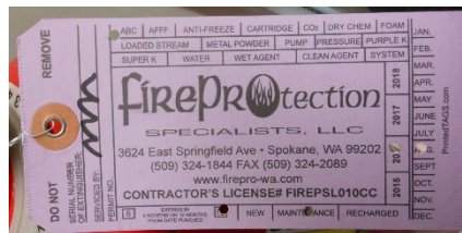
Inspection Card, front and back