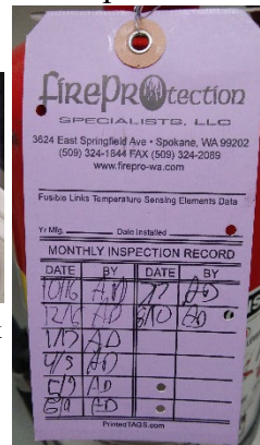
Inspection Card, front and back