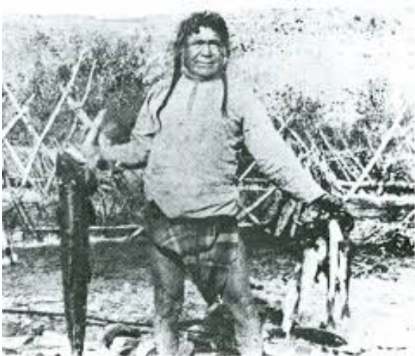
Colville Indians