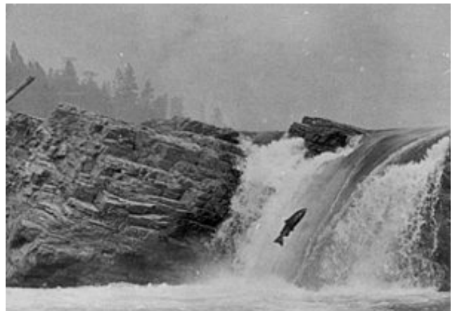
Salmon Leaping at Kettle Falls