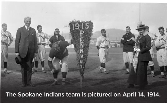
The Spokane Indians team is pictured on April 14, 1914.

memorabilia highlighting traditions, clubs, sports, activities and academics spanning the decades.