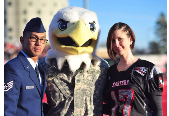
Veterans were recognized at every home Football game - Thank you Athletics Department for your support.