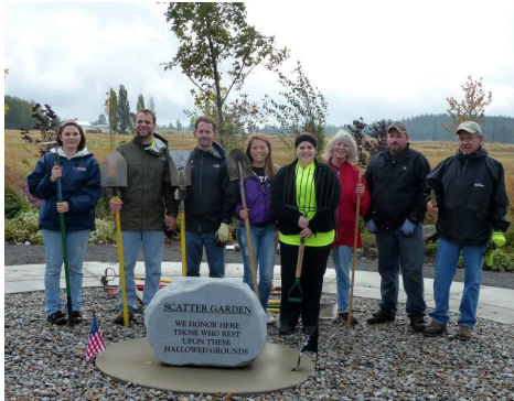
Community Service Project at the WA Veterans Cemetery in Medical Lake. Thanks EWU Community Engagement Office for organizing this.

We hope everyone had a successfully Fall Quarter. Congratulations to those student veterans who graduated!! We kept busy with several events throughout the quarter—celebrating Veteran’s Day is always a highlight, along with the USMC Birthday. The VRC staff (and Lounge) are always available to support all veterans on campus.